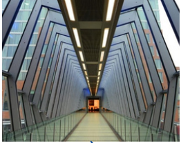
Tower 401 Skybridge