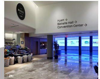
Greater Columbus Convention Center