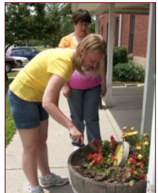
Two members of the Huron County Board of DD Job Club planting flowers at the senior building, which was a recent project.

The agency provides for the services through Christie Lane School , Huron County Help Me Grow , Early Intervention, Family Resource Services, Christie Lane Industries , Sheltered Employment, Community Employment, Recreation/Athletic Programs, Adult Habilitation Services, Service and Support Administration and Residential Opportunities.