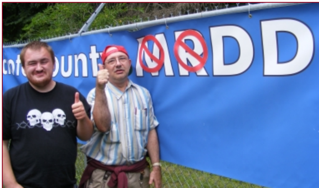
The People First president and vice president give the “thumbs up” signal to taking the letters MR out of the Scioto County Board of MRDD .